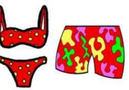
a swim suit/ bathing suit (B)