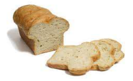
bread/ a piece of bread/ some bread