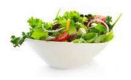
a salad/some salad