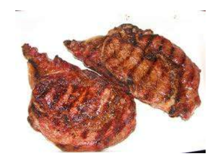
steak/ a piece of steak/some steak