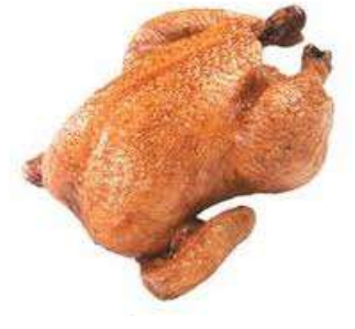
chicken/ a piece of chicken/ some chicken