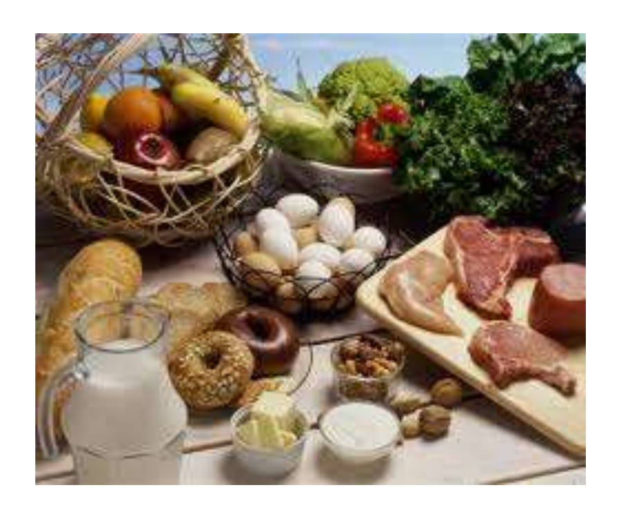
What is it? Look at the picture. How many food items do you know?