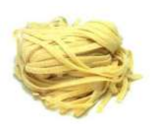
pasta/ some pasta

"Some" is used when talking about an amount of food that is not big or small.