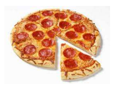
pizza/ a piece/slice of pizza/ some pizza